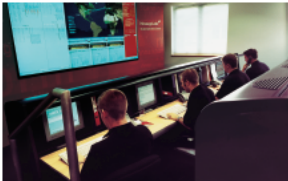
Global Operations Centre (GOC)

Sign up for the SkyScan service and you'll receive unprecedented levels of technical and customer support through the MessageLabs Global Operations Centre (GOC). Based in the UK, the GOC supports customers worldwide 24x7x 365, has multi-lingual abilities and is backed up by local operations in key locations. Additionally, our support technicians monitor the network and the e-mail passing through the system to ensure the SkyScan service is continually updated. So you don't have to worry about a thing.